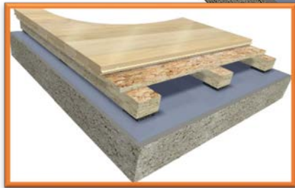
Option to specify Action Hardwood Premium Sheathing (HPS)

Action E-Cush 3/8" (10 mm) pad or 7/16" (11mm) AT II Natural Rubber pad